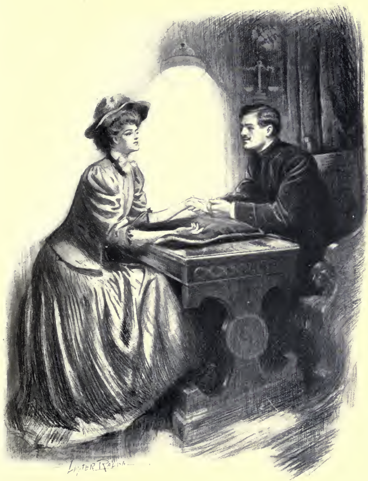
He took her hand, testing its quality and texture Page 52